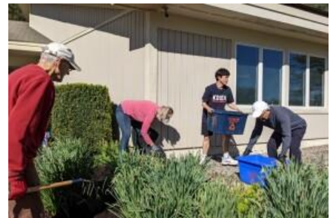
Clean-up day, 2023